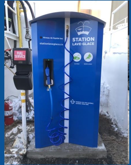
Minerai Fer QC